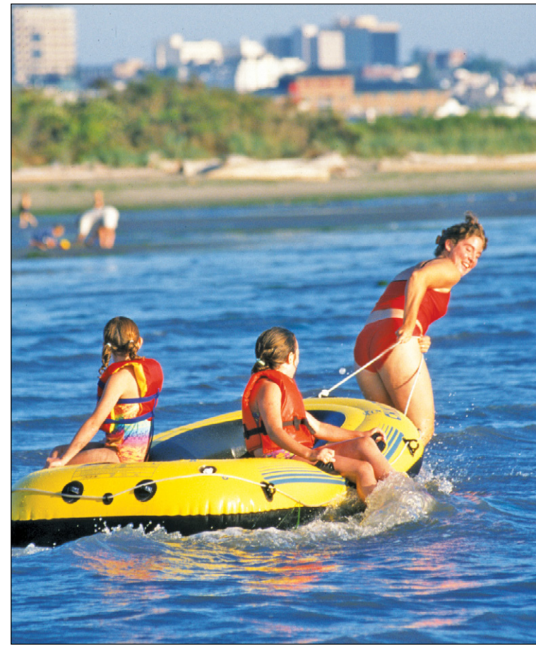
Young and old alike enjoy the shallow, warm water and sandy beaches on Everett's Jetty Island July 5 – September 7.