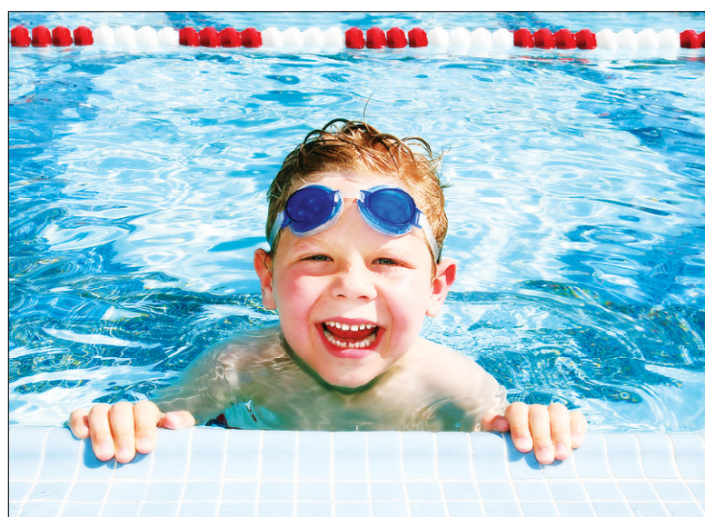
April Pool's Day at Forest Park Swim Center is April 18.

tree lighting and a visit from Santa. 4:30-7:30 p.m. at Wetmore Theater Plaza, 2710 Wetmore.